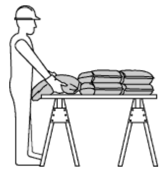
Store bags at waist height